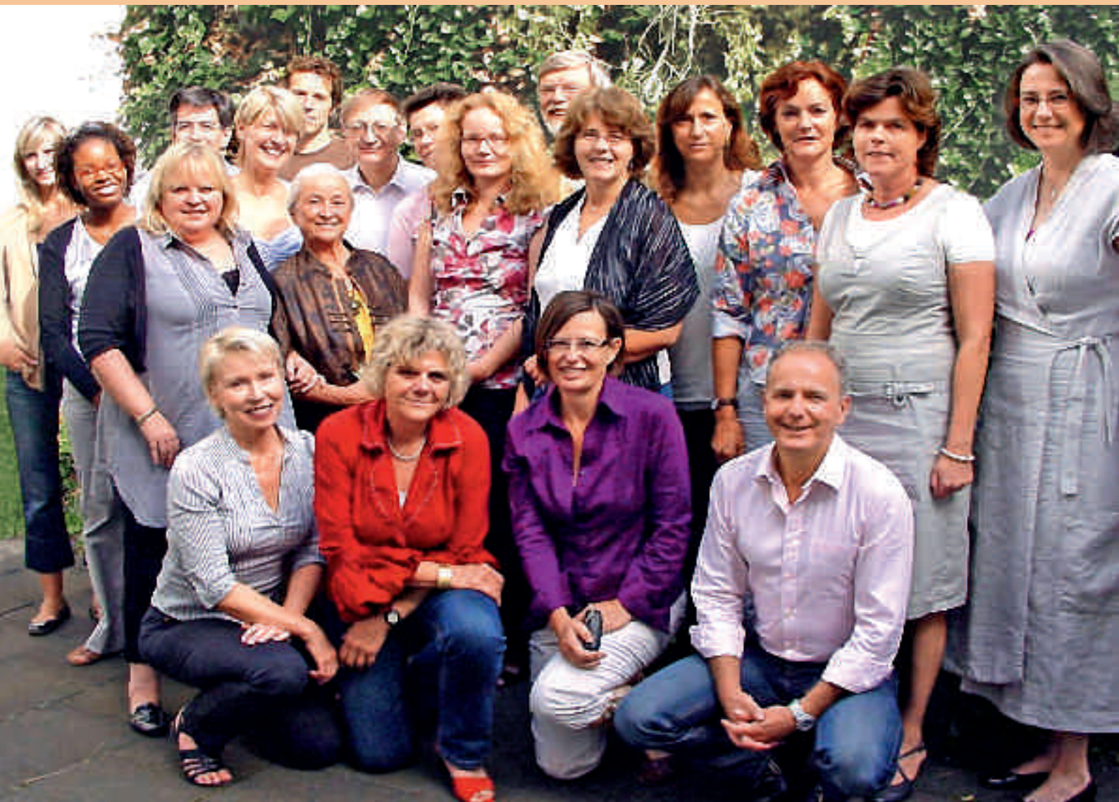
Between November 2008 and December 2009, a series of four workshops was organized by BZgA in Cologne, at which the invited experts jointly developed the Standards.